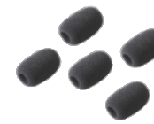
KT-126579-01R Replacement windsocks (5 pk)