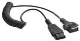
25-114186-03R Adapter cable with a coiled section for WT41N0