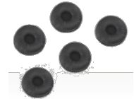
KT-126580-01R Replacement earpads leatherette (5 pk)