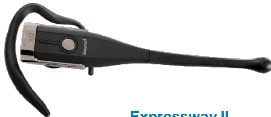
Expressway II Bluetooth Headset for WT41N0