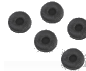
KT-126574-01R Replacement ear pads foam, (5 pk)