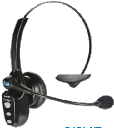
B250-XT+ Bluetooth Headset for WT41N0