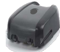
KTBTRYRS50EAB02-01 Extended Lithium Ion battery, 1940 mAh