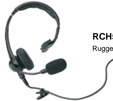
RCH51 Rugged cabled headset