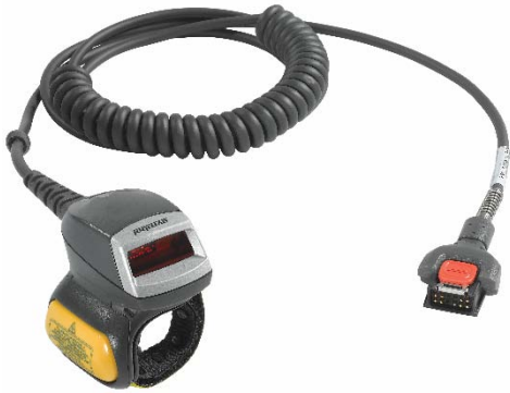
RS419-HP2000FLR Ring scanner for WT41 hip mounted.