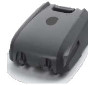
KTBTRYRS50EAB00-01 Standard Lithium Ion battery, 970 mAh