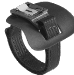
SG-RS419-FGSTP-01R Long replacement finger strap for ring scanner (7.8")