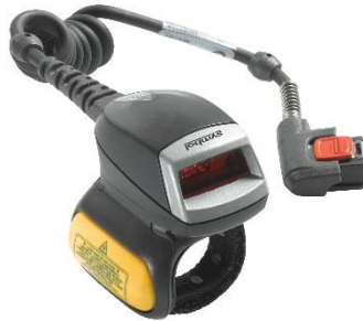
RS419-HP2000FSR Ring scanner for WT41 wrist mounted.