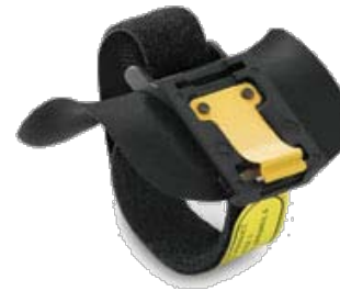
21-93022-02R Short replacement finger strap for ring scanner (6")