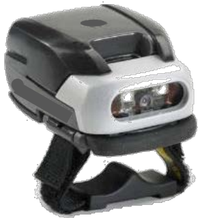
RS507-IM20000ENWR Imager without trigger and extended battery