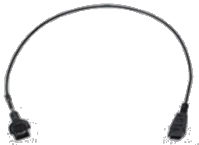
25-124412-02R Long adapter cable (19") for WT41N0 (hip mounted)