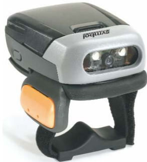
RS507-IM20000STWR Imager with trigger and standard battery