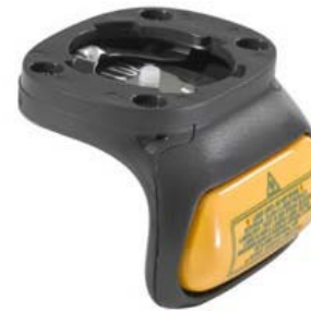
SG-RS419-TRGAS-01R Replacement trigger assembly for ring scanner.